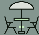
OUTSIDE BREAKOUT AREAS