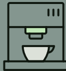
KITCHENETTE WITH UNLIMITED TEA & COFFEE